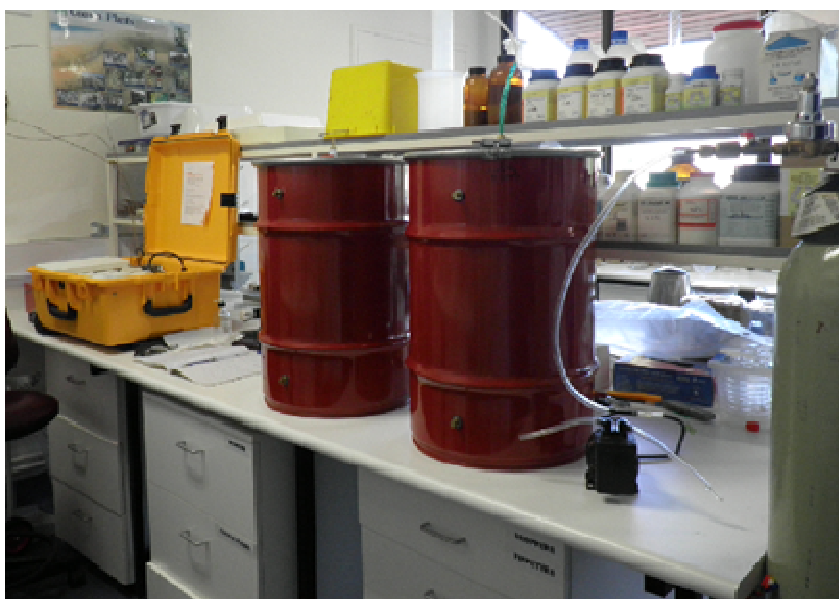
Figure 2. The fumigation chamber (47.8 cm x 40.6 cm internal diameter) equipped with gas injection and sampling systems.

The fumigation chamber (47.8 cm x 40.6 cm internal diameter) was constructed from steel with the net volume of the chamber being 62 litres. The removable lids were fitted with a centrally located septum fitting for introduction of gas during fumigation. The fumigation chamber was fitted with two gas sampling ports which were located on the side of the fumigation chamber near the top and bottom (Figure 2). Each lid was fitted with gas-tight seals which were pressure-tested before use. The fumigation chambers were well-sealed with a pressure halving time of greater than three minutes.